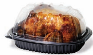
HomeFresh® Rotisserie Chicken Container