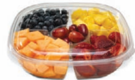
Fresh 'n Clear™ Multi-Compartment