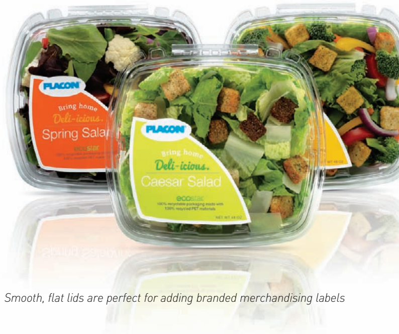
Smooth, flat lids are perfect for adding branded merchandising labels

Crystal Seal Tamper-Evident containers are another smart, sustainable solution with the quality and performance you'd expect from Placon food packaging products. For samples, call 800.541.1535 or email info@placon.com .