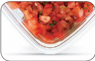
Consumer-friendly, leak resistant containers seal in juices and sauces for car to home carry confidence.