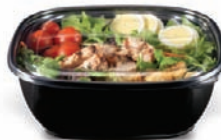
Fresh 'n Clear™ Bowls and Lids