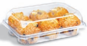
Dimensions™ Bakery Containers

For samples or to request additional information about any of our product lines, call 800.541.1535 or email us at info@placon.com .