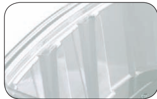
Patent-pending post feature aligns the lid and base for easy closing while enhancing the container's tamper resistance.

Crystal Seal Tamper-Evident containers are another smart, sustainable solution with the quality and performance you'd expect from Placon food packaging products. For samples, call 800.541.1535 or email info@placon.com .