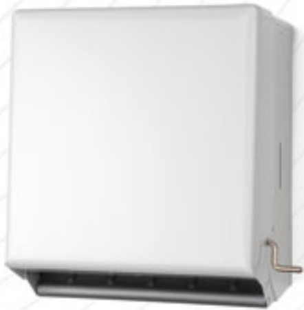
Model 185/186 Crank Roll Towel Dispenser