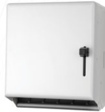
Model 195/196 Lever Roll Towel Dispenser