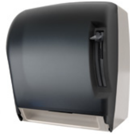
Model 185/186 Crank Roll Towel Dispenser

Accommodates rolls 8" in diameter and roll widths from 7" - 9.5" Equipped with wire form roll holder specifically to suspend rolls 8" wide Heavy gauge steel body and cover Width 11.75" Height 11.88" Depth 8.63"