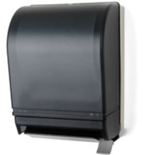
Model 210 Lever Roll Towel Dispenser