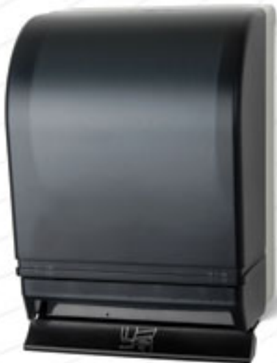
Model 215 Lever Roll Towel Dispenser