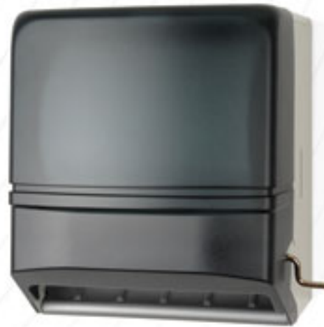
Model 190/191 Crank Roll Towel Dispenser